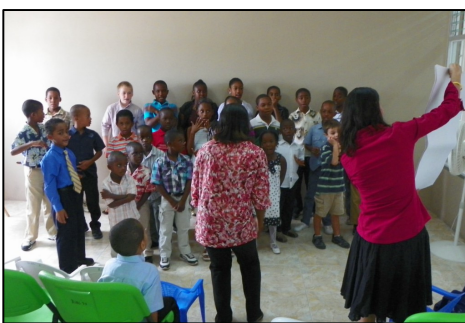
Final practice before the Christmas Presentation